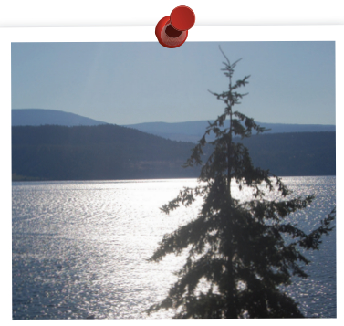
Our Kelowna alumni are camera shy, but it was a great evening in a beautiful city!